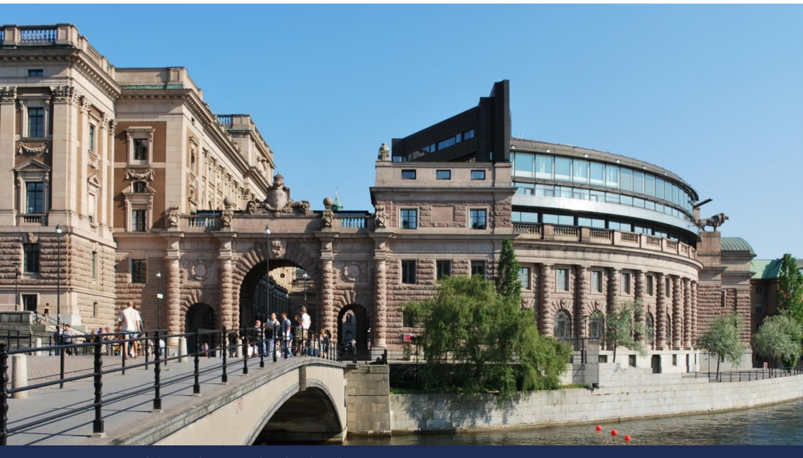
Figure 2:

June 26: <u>Presidency Conference on the</u> <u>Future of Life Sciences</u>